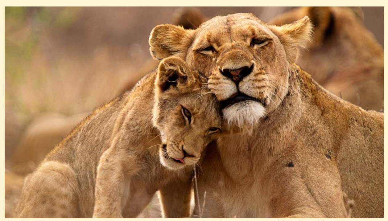
Thanks to our supporters, we are ensuring that more lions can live as they should: in the wild.