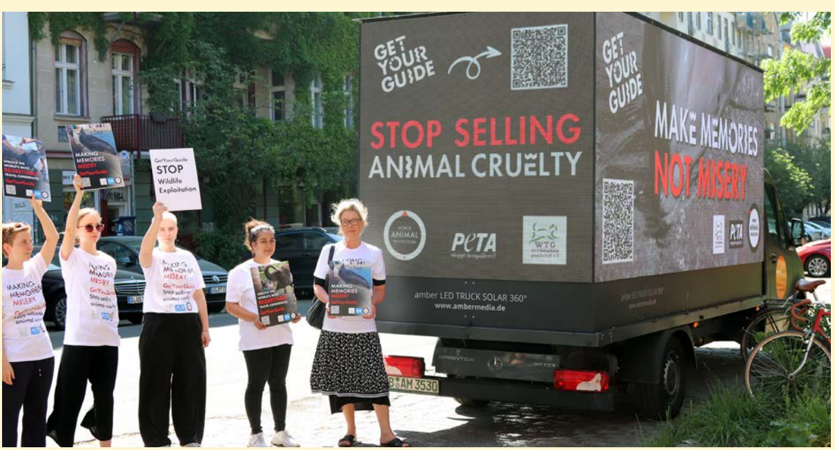
In May 2024, we were outside GetYourGuide's Summer Summit in Berlin. A mobile LED truck screened a powerful video amplifying our message to stop selling animal cruelty.