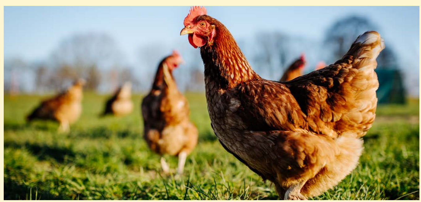
The Good Food NY bill will allow public institutions to make values-based decisions in food procurement, including increasing plant-based foods, instead of requiring the lowest cost option.