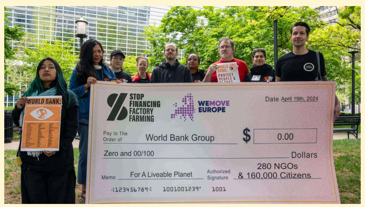
We partnered with WeMove to generate support from thousands of individuals and 280 organizations to stop the World Bank from supporting factory farming.