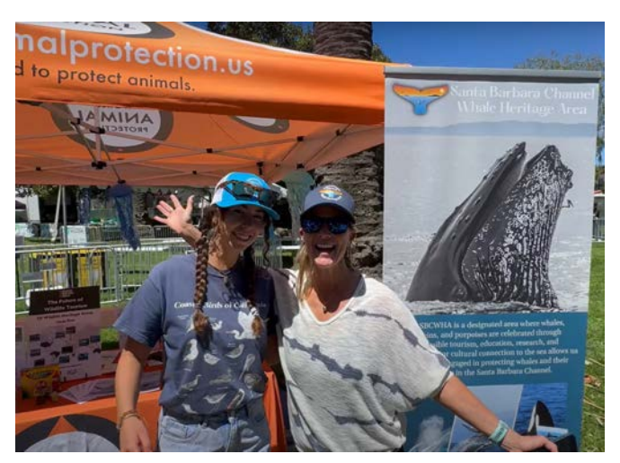
We inspired people to learn about protecting animals and the environment at Santa Barbara's Earth Day in April.

In 2022, we launched a new program, Wildlife Heritage Areas, to help create an ethical alternative to captive wildlife experiences. Since then, 15 areas around the world have been designated. The latest area, Living in the Forest with Elephants (LIFE), is located in Thailand and is the first heritage area focused on elephants.