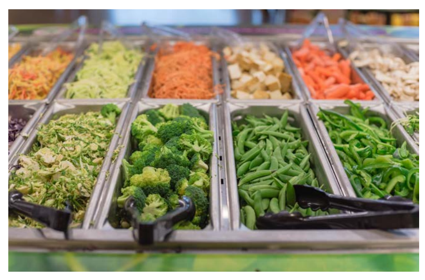
The bill to incentivize New York's public institutions to increase procurement of plant-based foods received overwhelming bi-partisan support.

This victory reflects over 3 years of advocacy through coalition building, local advocates, and broad statewide efforts. The New York State Good Food Purchasing Program coalition is planning strategic actions to ensure Governor Kathy Hochul signs the bill into law.