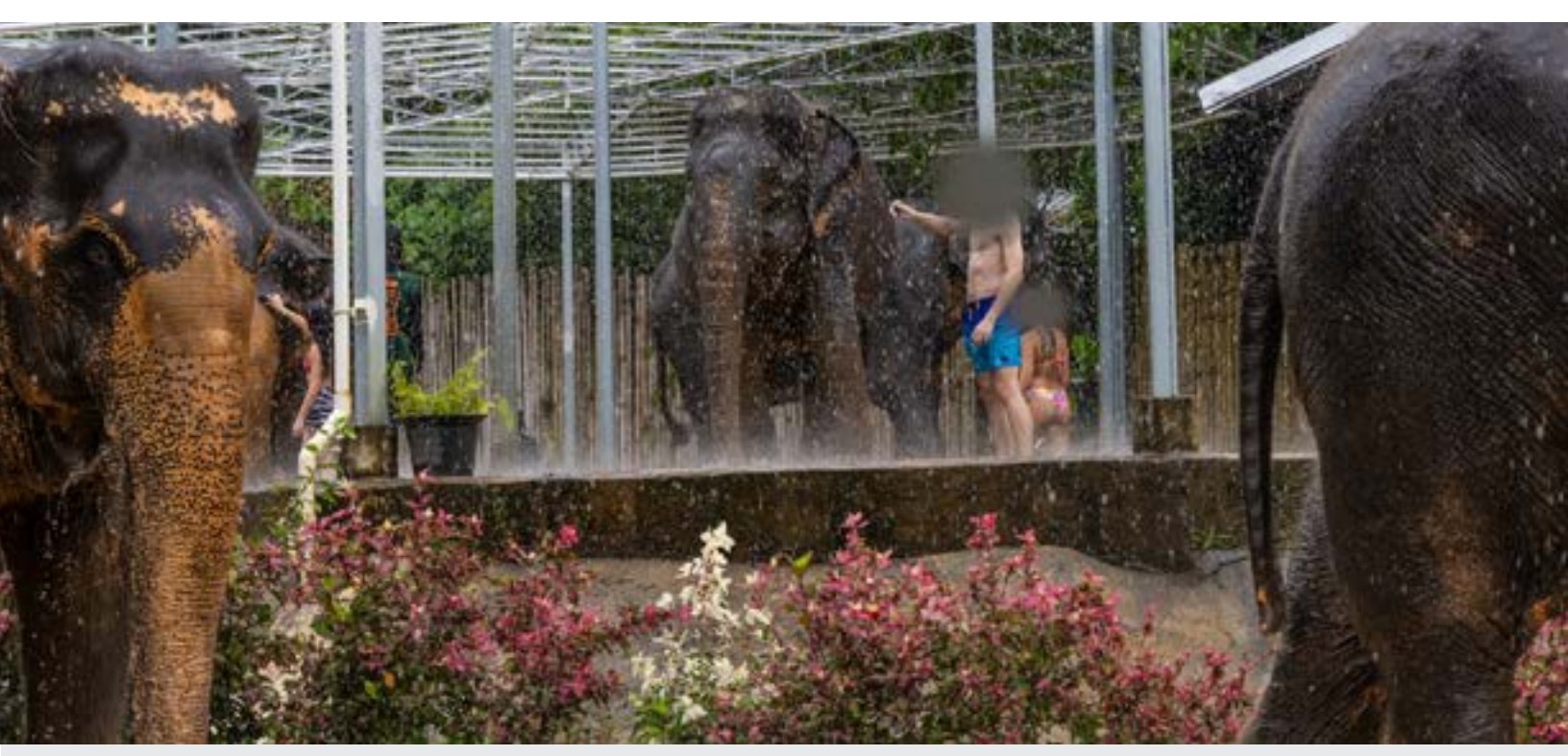
Tourists bathe elephants at a Thailand elephant camp. The setup is intended to mimic a car wash.

Growing awareness among tourists that elephant riding is cruel has ironically resulted in a boom of elephant washing venues, with the number of venues in Thailand offering elephant bathing more than tripling. As many tourists reject elephant riding, they're now being encouraged to bathe and take selfies with elephants. But seemingly "benign" interactions like bathing and posing for photos inflict just as much suffering. Making elephants engage in unnatural activities like being bathed by people requires intensive, abusive training.<sup>35</sup>