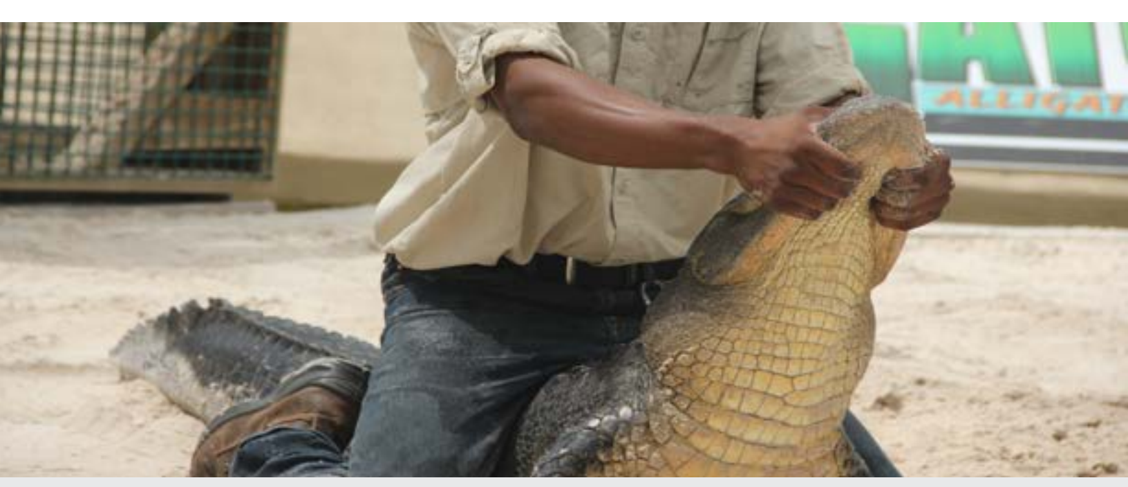
Example of alligator "wrestling."

Tying alligators' jaws shut and manually restraining them causes extreme stress.<sup>54</sup> One study determined that physical restraint was more stressful for crocodiles than stun guns, taking up to eight hours for blood stress levels to lower after being restrained between two and 15 minutes.<sup>55</sup>