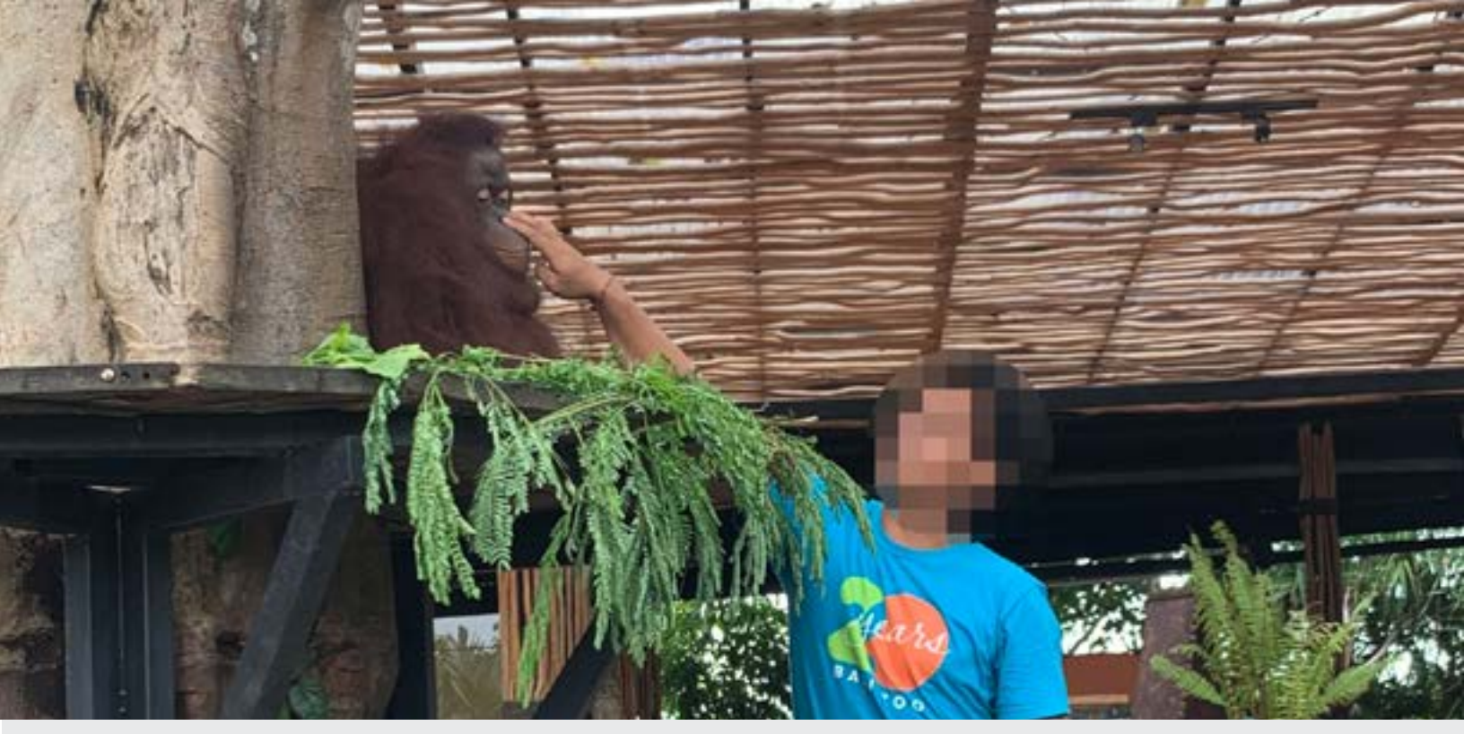
A person sticks his fingers into an orangutan's nose at the Bali Zoo.