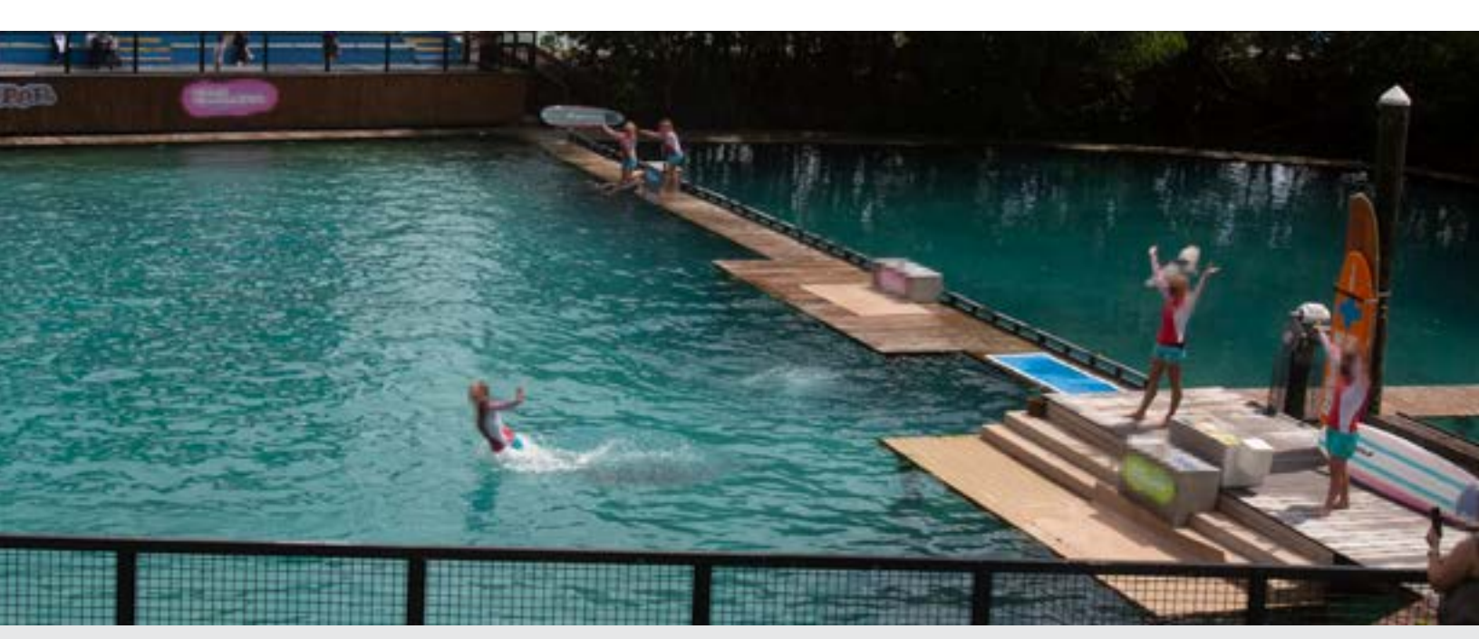
The pool where MSQ holds dolphin shows. Sundance was kept here.

Sundance, a 33-year-old bottlenose dolphin, died in December 2023 at MSQ after being used to entertain crowds for more than three decades. The previous month, Sundance had been showing signs of gastric distress, suggesting he was suffering from ulcers or had ingested foreign bodies. However, because MSQ lacked basic veterinary equipment, the veterinarian was unable to perform an endoscopy to confirm the diagnosis and provide treatment.<sup>22</sup> Despite Sundance's serious condition, he was used in all of MSQ's holiday shows.<sup>23</sup> He died shortly after Christmas.