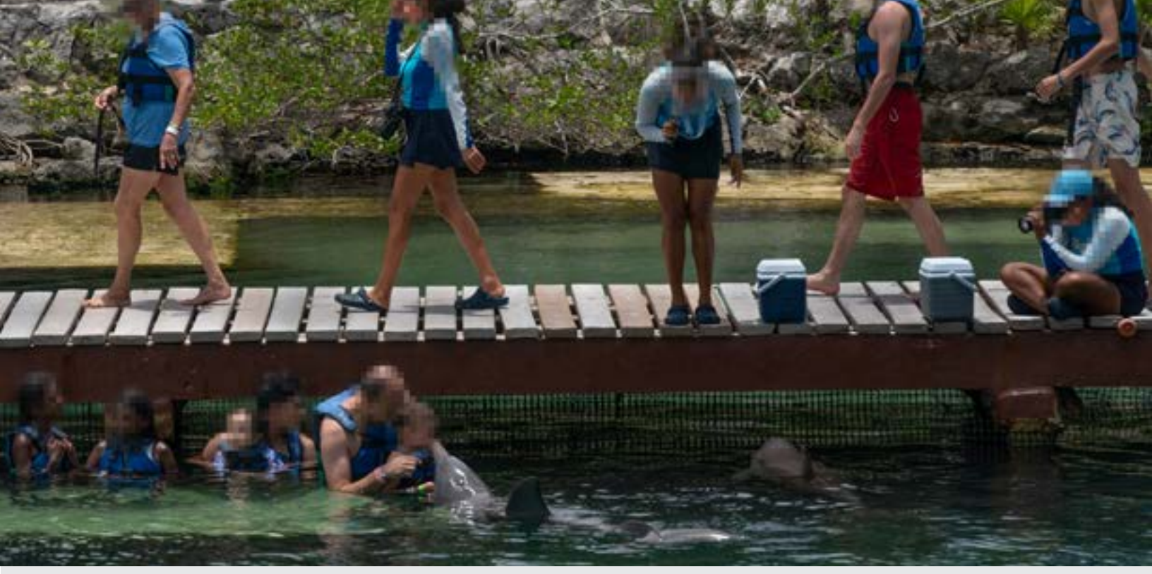
Dolphins at an undisclosed dolphinarium in Mexico.