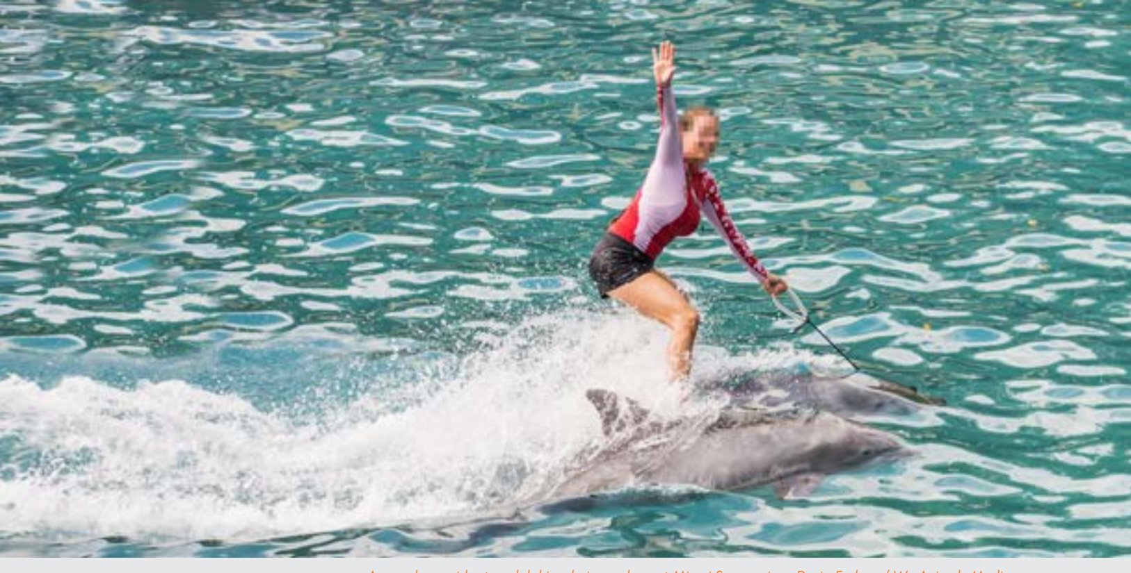
An employee rides two dolphins during a show at Miami Seaquarium. Dario Endara / We Animals Media.