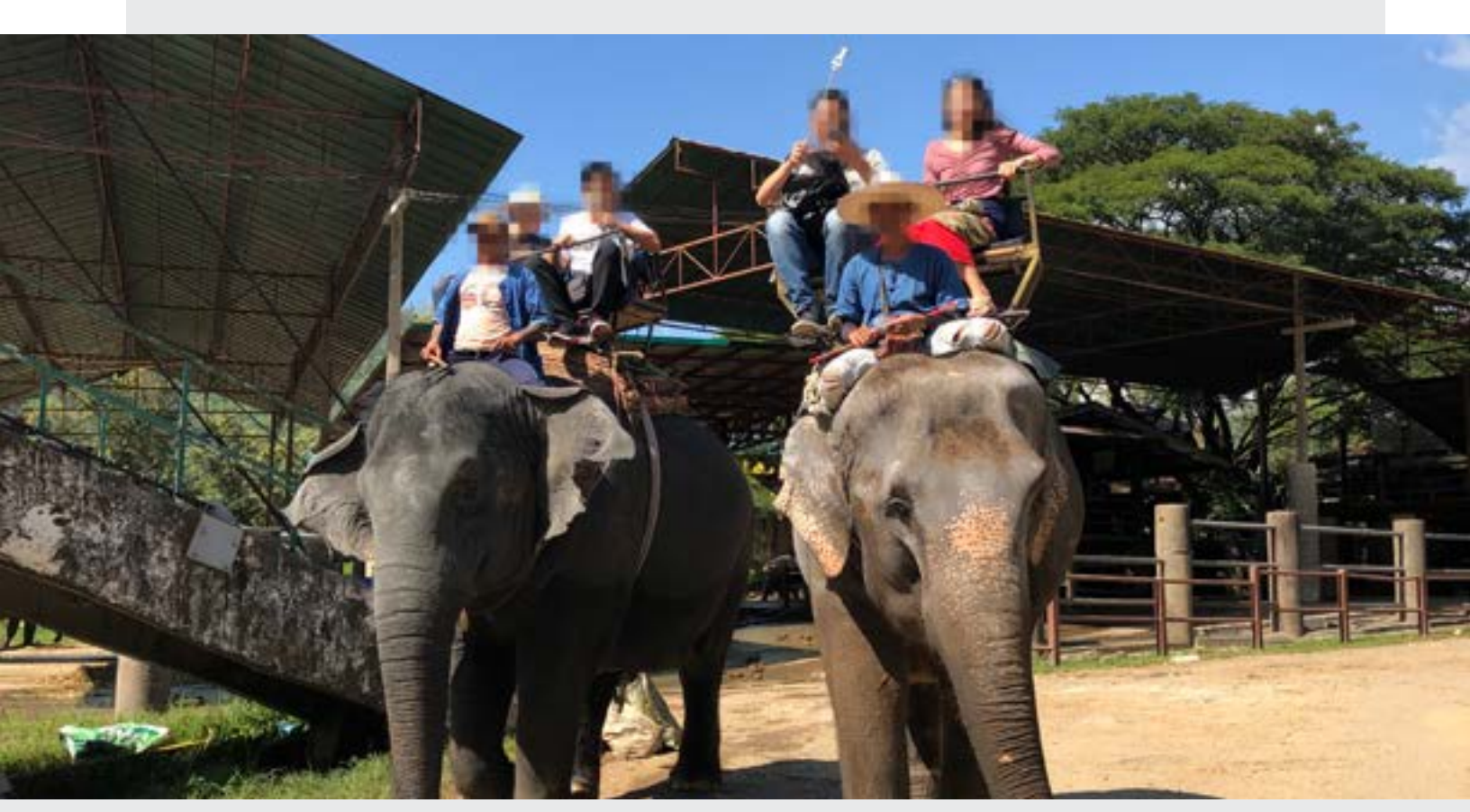
Elephants give rides in Thailand.

The tourism industry has a responsibility to provide experiences that don't exploit animals or endanger their customers. Instead of fueling cruel businesses, travel companies should be educating the public about compassionate and sustainable travel. We've worked with leading global tourism companies including Airbnb, Booking, Expedia, and TripAdvisor to change their animal welfare policies. Leading travel companies have already adopted wildlife-friendly policies while GetYourGuide falls behind. As the list of wildlife-friendly companies grows, GetYourGuide increasingly stands out as a company that doesn't care who suffers—as long as it improves their bottom line.