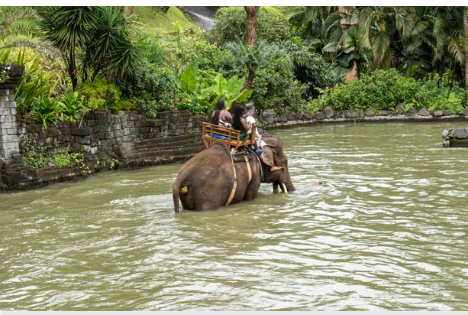
Tourists ride an elephant at the Bali Zoo.