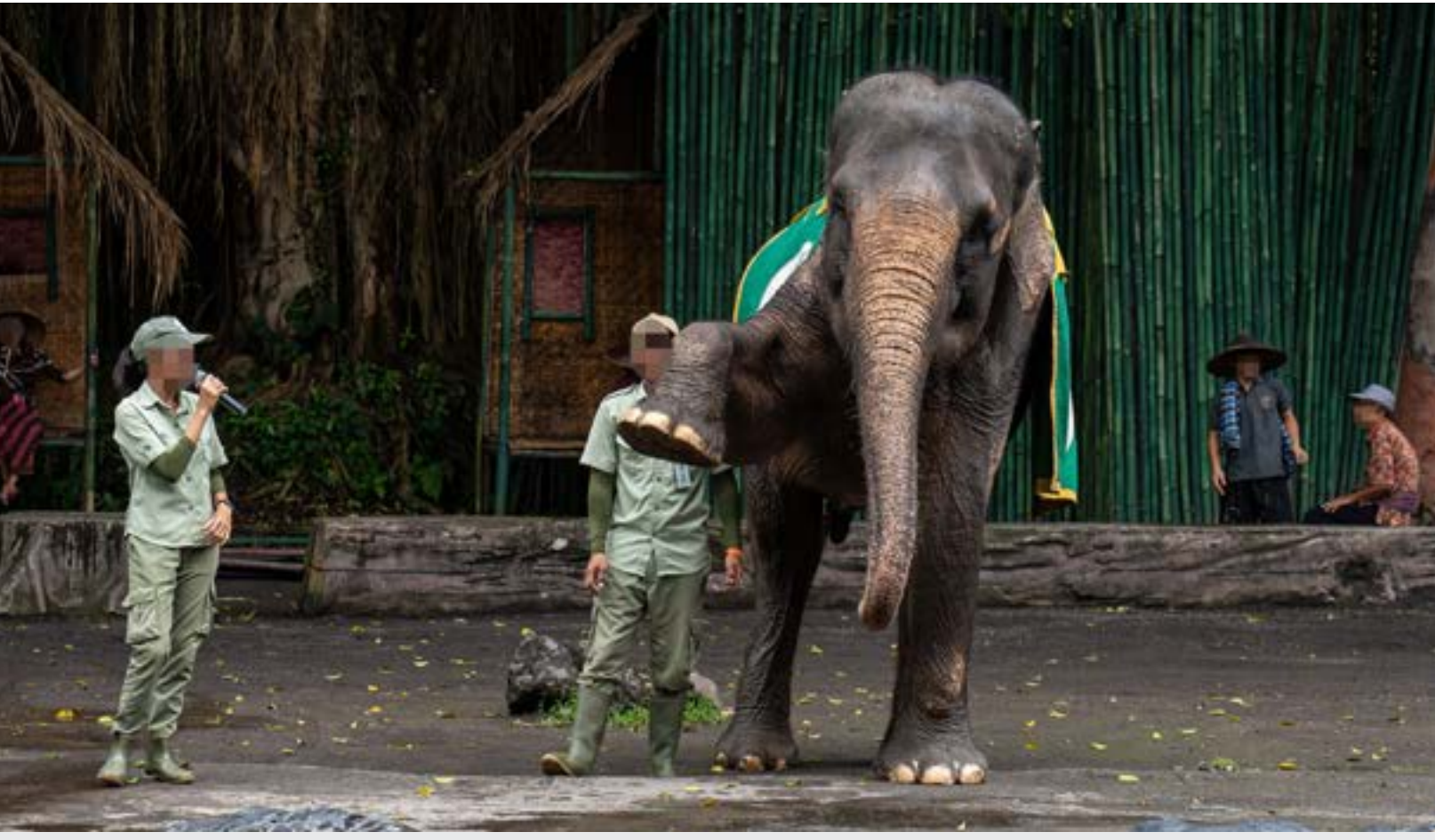
An elephant performs at Bali Safari Marine Park.