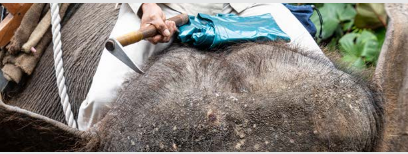
An elephant is threatened with a bullhook at Bali Zoo.