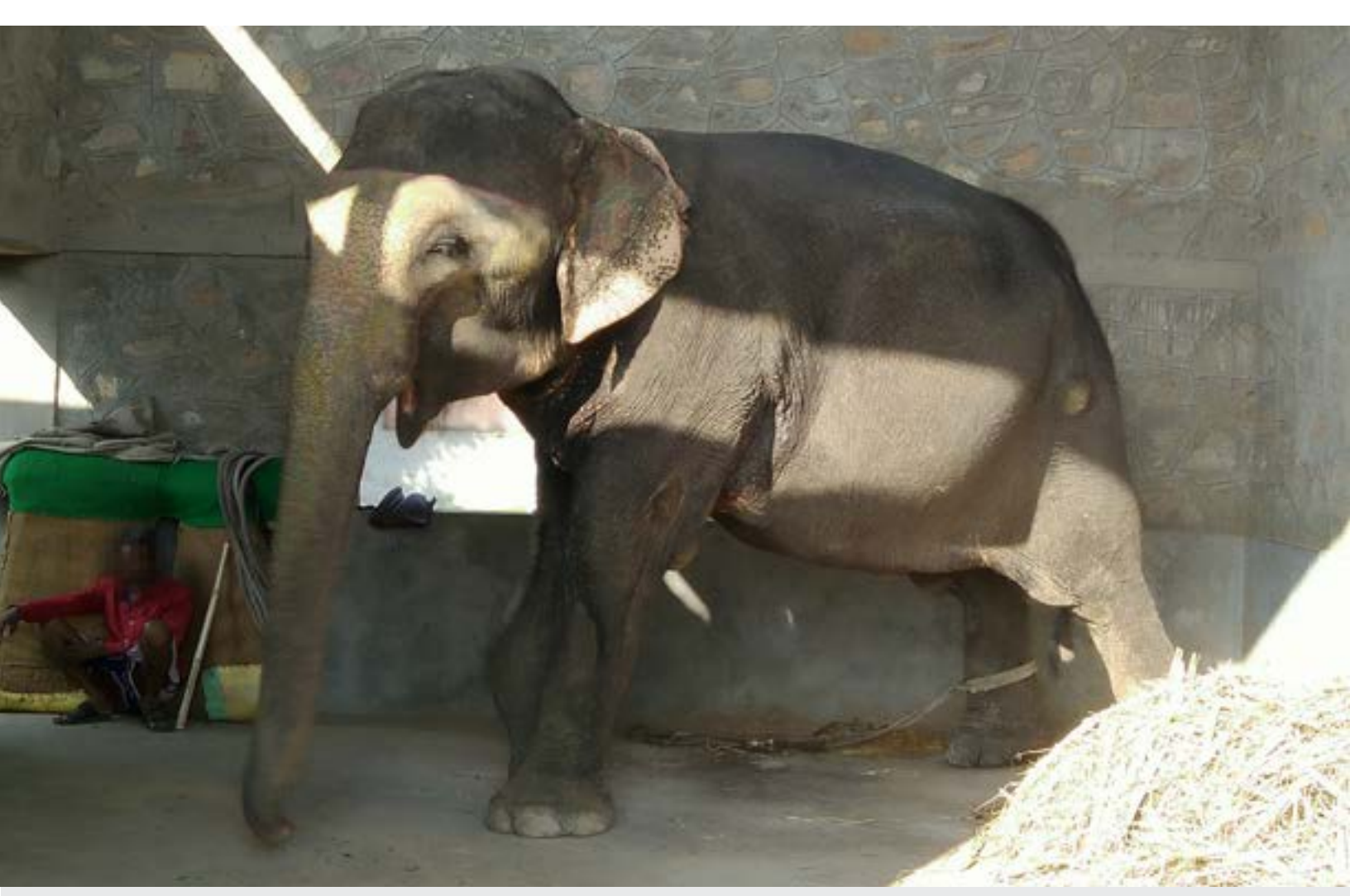
Elephants at Amer Fort suffer from many health issues.

They are fed an inappropriate diet, which can further exacerbate health conditions. Visitors have reported seeing elephants with inadequate water or no water at all.