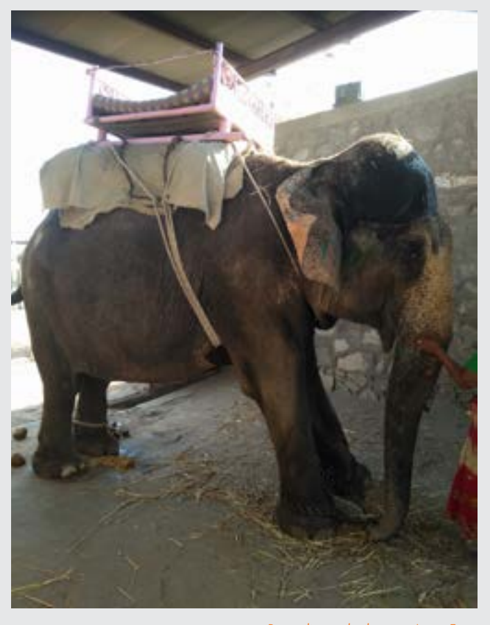
Rangoli, an elephant at Amer Fort.

One of the oldest working elephants at Amer Fort, 51-year-old Rangoli has suffered her entire life to entertain tourists. She was likely caught from the wild as a baby, endured the severe trauma of being forcibly separated from her mother, and put through a cruel and intensive "breaking-in" process to make her submissive enough to give rides. During this process, young elephants are tied to wooden structures and hit with hooks, sticks, or sharp metal objects. Today and every day, Rangoli carries tourists on her back, walking up and down the hard cobblestone roads to the top of the hill. She is hit or threatened with bullhooks on the most sensitive parts of her body to keep her compliant. At night, she is sometimes chained, sometimes standing in her own feces, waiting until morning when she will work again.<sup>33</sup>