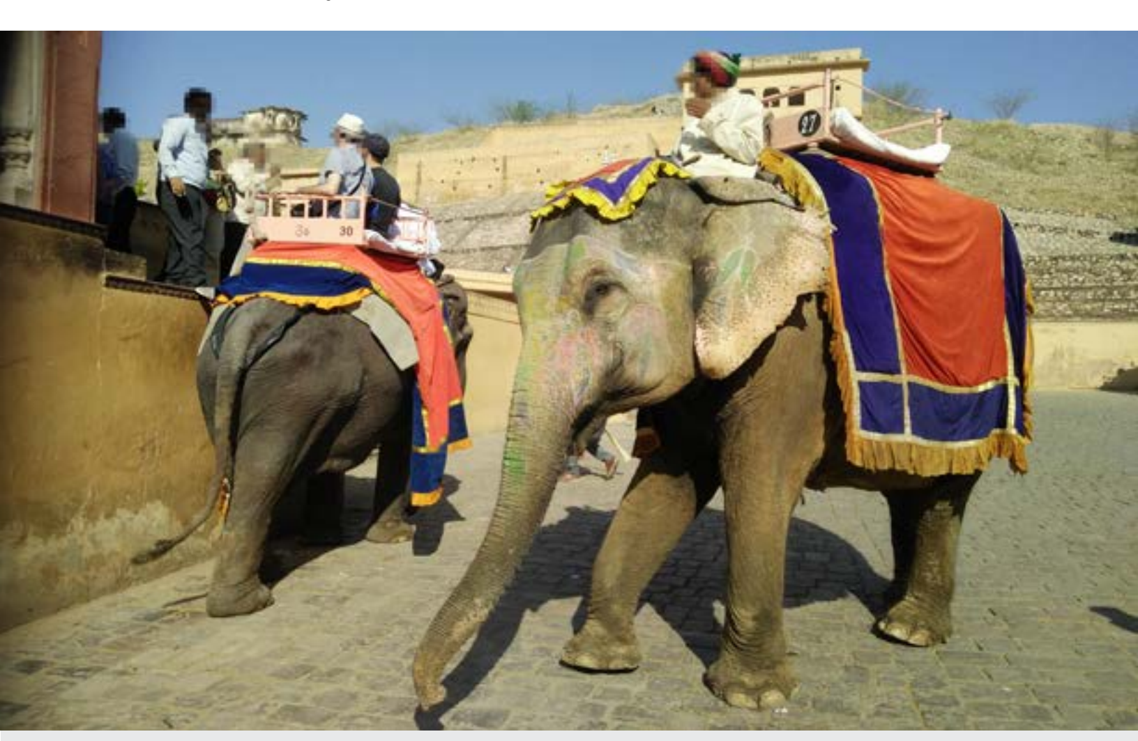
Elephants at Amer Fort.