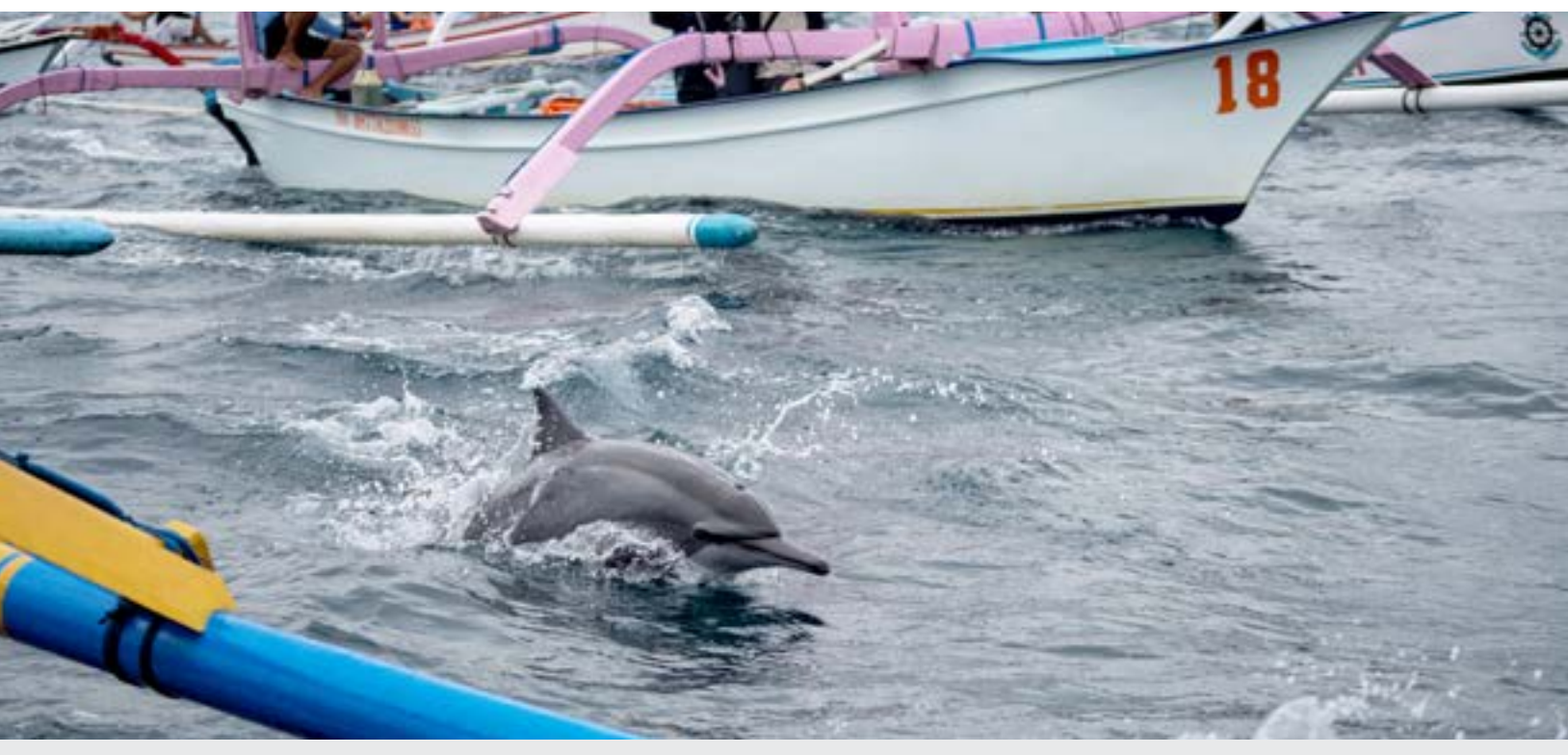
Dolphins surrounded by boats at Lovina Beach. Andito Wasi.

At Lovina Beach, dolphin watching companies engage in risky practices that endanger the free-roaming dolphins. During the peak season, more than 100 boats swarm the waters of Lovina, chasing down juvenile dolphins. Businesses compete to get tourists as close to the dolphins as possible. All boats observed failed to give dolphins adequate space or turn off the engines when near the animals, creating a noisy and stressful environment. Investigators observed a boat striking a dolphin, and the welfare of the animal is unknown.