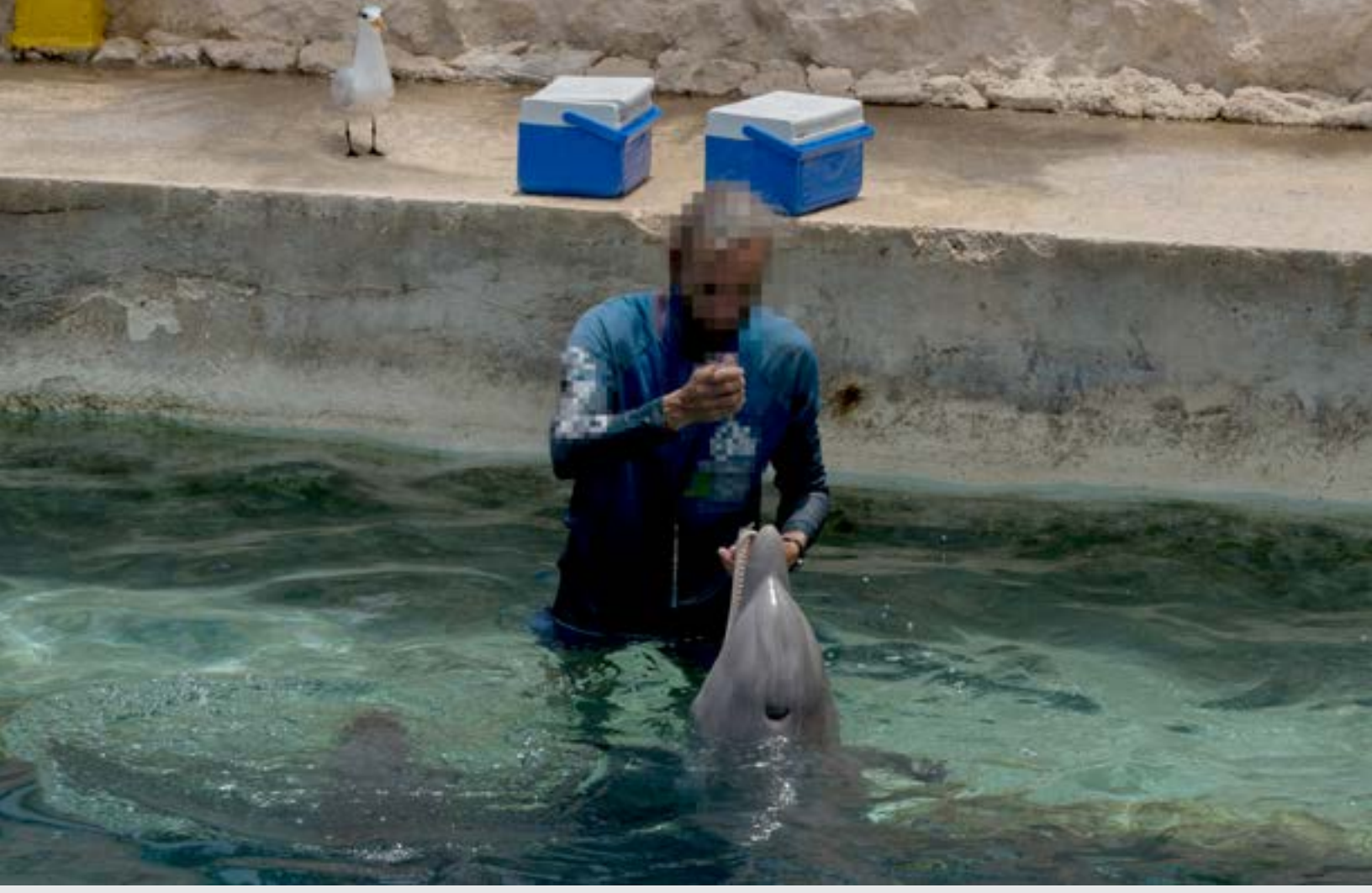
A dolphin in a concrete tank in Mexico.