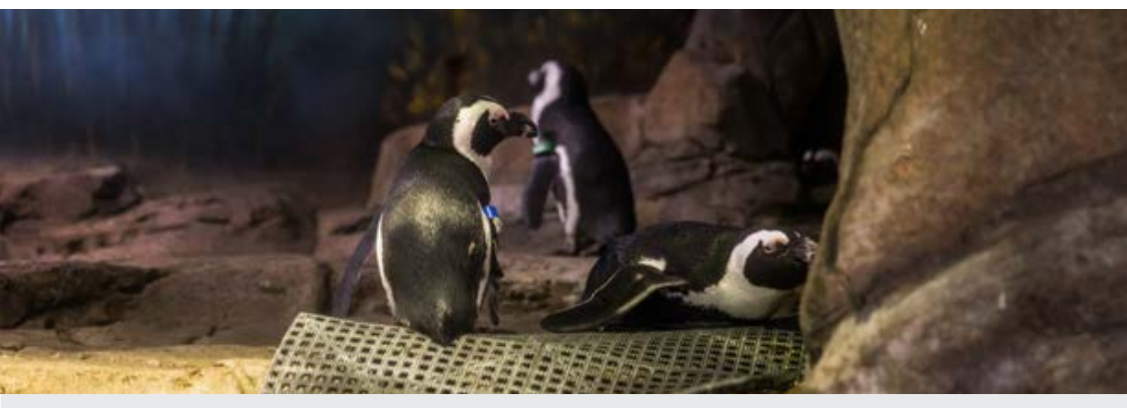
Penguins at Miami Seaquarium are held in a small, poorly ventilated building with what appears to be black mold.

MSQ is a marine amusement park with a laundry list of animal welfare violations for issues including lack of veterinary care, structurally unsound facilities, and inappropriate housing of marine mammals that has resulted in animal deaths. Miami-Dade County is in the process of terminating the park's lease for poor animal care and failure to pay rent.<sup>20</sup>