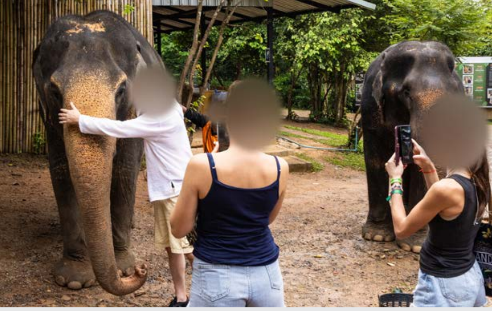
Tourists pose for photos with elephants at a Thailand elephant camp.