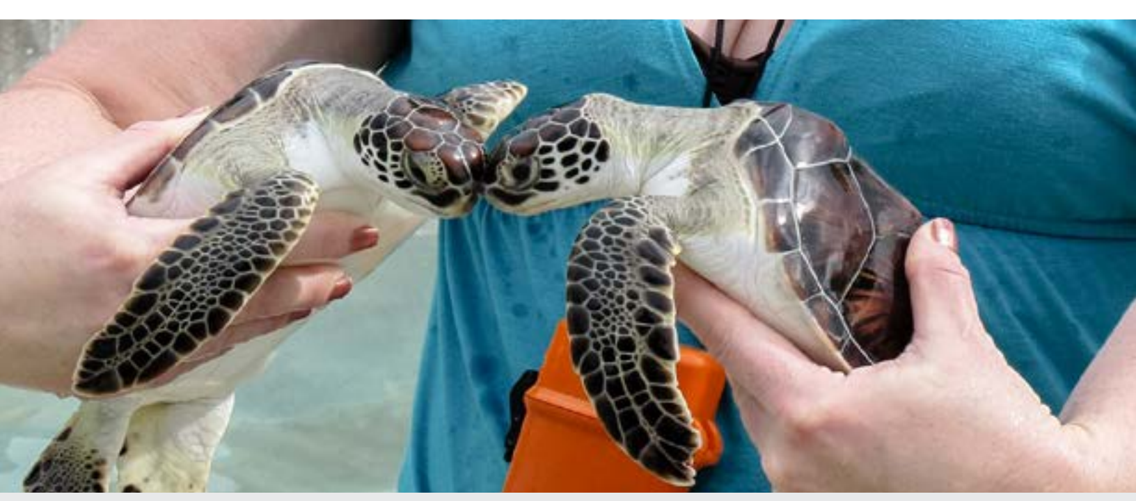
A tourist holds sea turtles at Cayman Turtle Centre.

Sea turtles are solitary, migratory animals who swim long distances across the ocean. At Cayman Turtle Centre, they're crammed into small, filthy tanks with thousands of other turtles.<sup>58</sup>