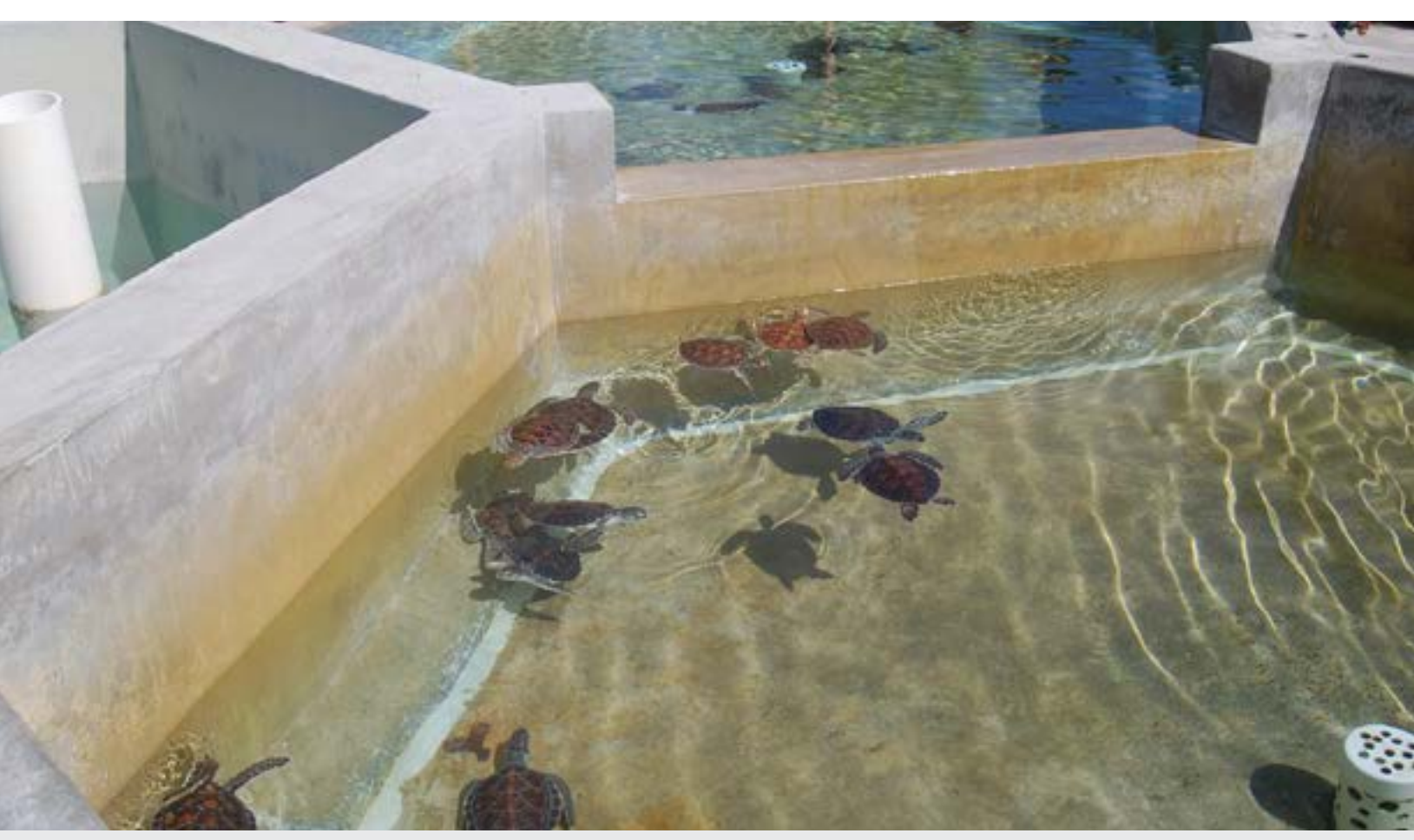
At the Cayman Turtle Centre, turtles are held in shallow, dirty enclosures.

"All you could see was this frothing bed of turtle heads coming up to the surface. They were constantly fighting to get to the surface to breathe. All the turtles you could see had injuries and bite marks from the others that were stacked on top of each other." – Former employee at Cayman Turtle Centre<sup>63</sup>